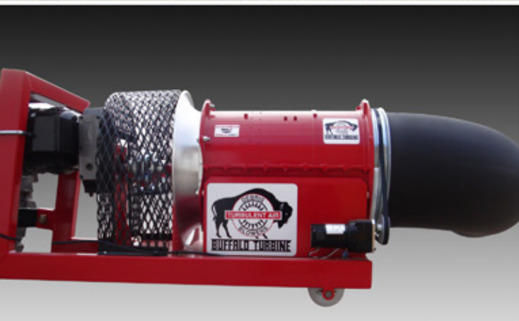
ANTI-SCALPING ROLLER FOR SOFT SURFACES