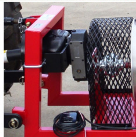
DIRECT DRIVE GEARBOX